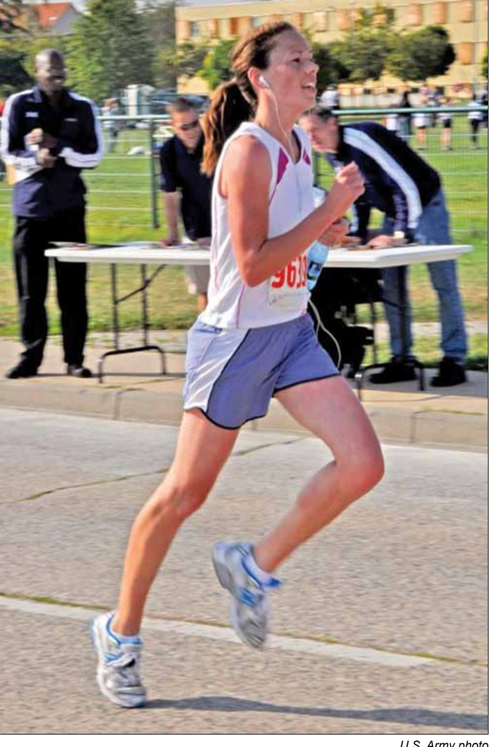
Installation Management Command has formed the "Army IMCOM" team to encourage command members to participate in the DoD's "Leap Into Fall" Fitness Challenge.

The DoD challenge is linked to the President's Challenge, which began as a national youth fitness test and is now a series of programs designed to help improve anyone's activity level.